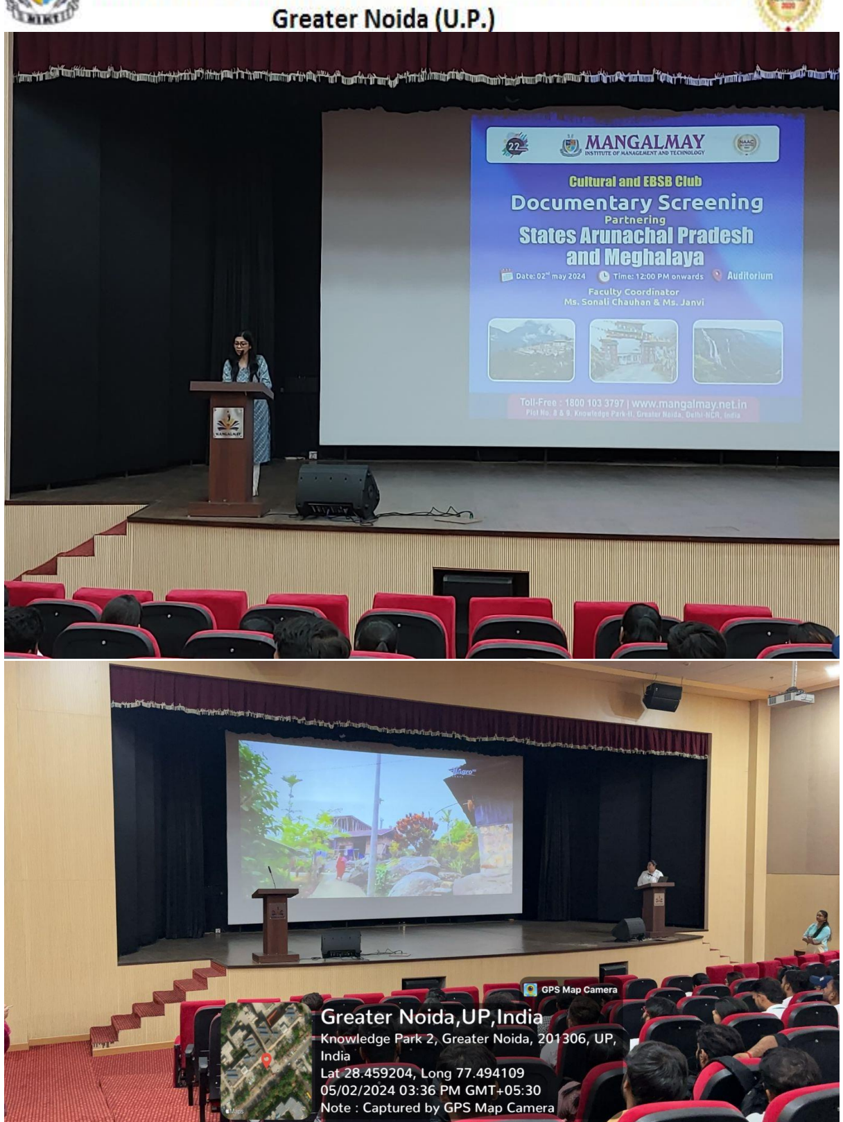
Students Exploring cultural heritage and natural beauty of Arunachal Pradesh and Meghalaya