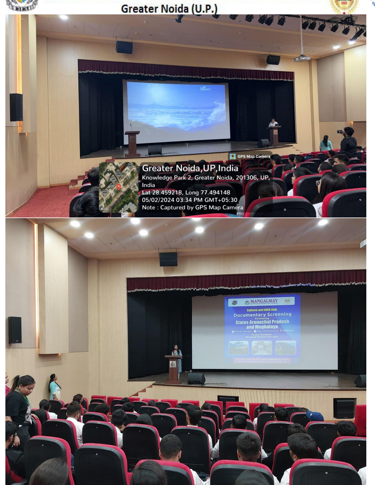
Students attending the documentary screening in auditorium

Mangalmay Institute of Management Technology