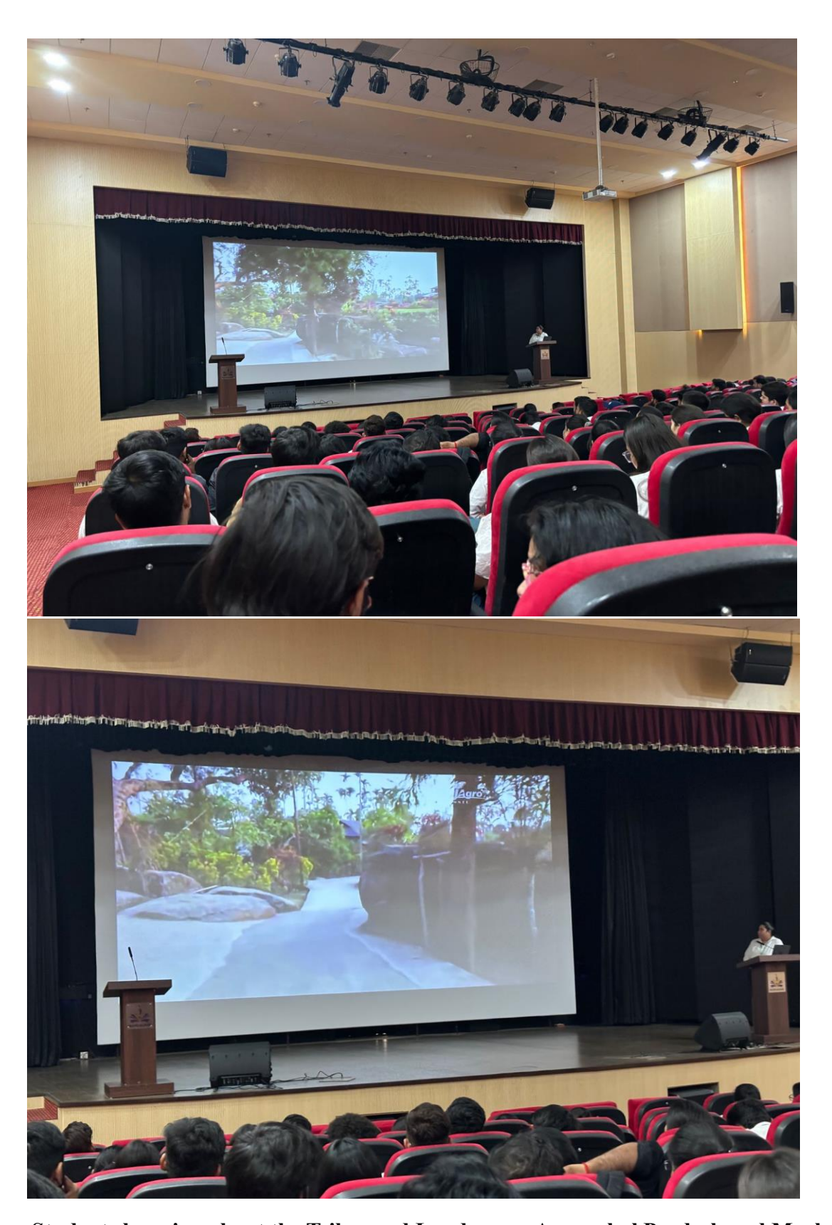
Students learning about the Tribes and Landscapes Arunachal Pradesh and Meghalaya